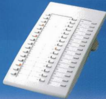
KX-T7740 DSS Console