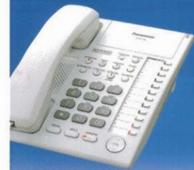
KX-T7750 Monitor Unit