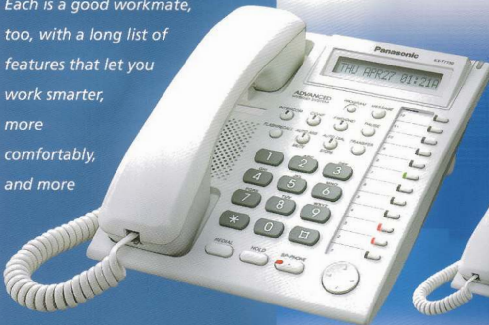
KX-T7730 Display Unit

The large display has easy-to-read characters.