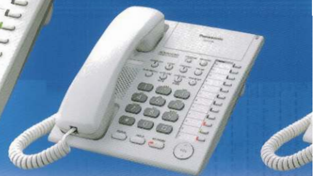
KX-T7720 Speakerphone Unit