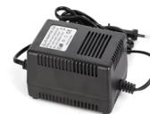
AC24V/3A Power Supply