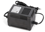
AC24V/3A Power Adapter